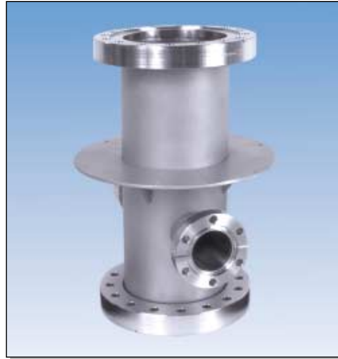
Chamber Mounting Flange